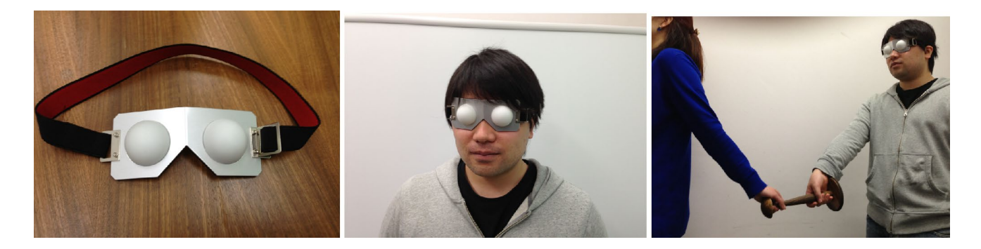
Fig. 1 The translucent Ganzfeld goggles used in this experiment and an illustration of how the experimenter used a wooden bar to guide participants

of vestibular system diseases. None of them were aware of the purpose of the experiment, although all had previously participated in vection experiments. Participants were randomly divided into two groups (Ganzfeld and Control conditions): twelve participants (seven males, five females; mean age 24.3) were assigned to the Ganzfeld condition, and thirteen participants (seven males, six females; mean age 26.9) were assigned to the Control condition.