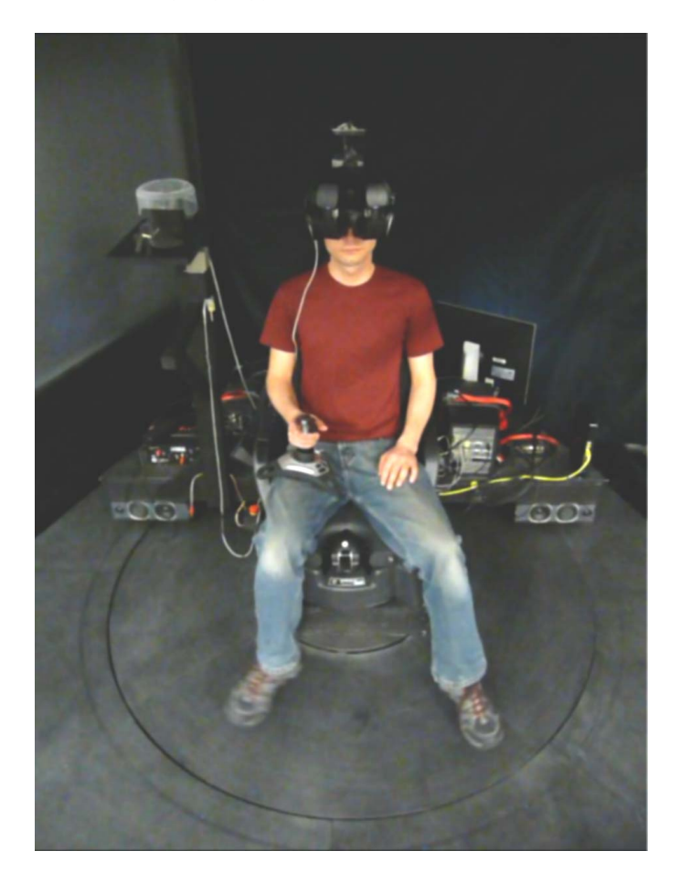
Figure 1. Experimental setup, showing the seated stationary participant stepping along the rotating circular treadmill. The head-mounted display (HMD) depicts the visual stimulus in the visual-only and bimodal conditions. For the biomechanical-only condition, the HMD was switched to black and participants were instructed to close their eyes. See included video or http://youtu.be/_vIVqpWINF0 for an illustration of the three stimulus combinations. A handheld joystick was used to indicate the onset, intensity, and convincingness of the vection percept.

motion illusions can be induced for rotations (circular vection ). For example, an observer seated inside a large textured cylinder (known as an optokinetic drum ) rotating about the earth-vertical axis reliably experiences a strong sensation of self-rotation (Brandt et al., 1973; Dichgans & Brandt, 1978). More recently, computer-generated graphics and VR displays have also been shown to elicit vection, especially if the moving visual stimulus covers a sufficiently large field of view (FOV; for reviews, see Hettinger, 2002; Palmisano, Allison, Kim, & Bonato, 2011; Riecke, 2011; Riecke & Schulte-Pelkum, 2013). Until recently, however, most vection researchers have informally observed that reliably inducing vection illusions in head-mounted displays (HMDs) was not possible, as at the time most HMDs provided relatively narrow FOVs. For this study we used a relatively wide-FOV HMD