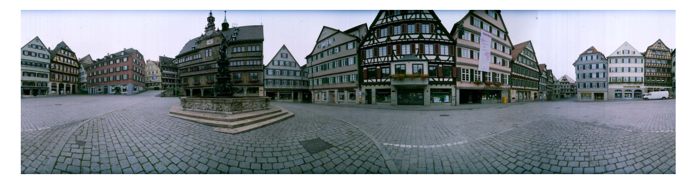
Figure 2. 360° panoramic round shot of the marketplace in Tübingen, Germany, that was used to create a naturalistic visual stimulus for visually inducing circular vection.

Two participants in each group were undergraduate students and one was a graduate student.